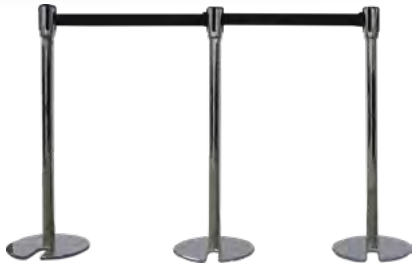
Brushed Metal Expandable Stanchions