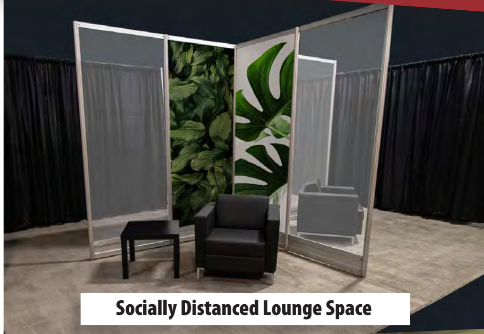
Socially Distanced Lounge Space