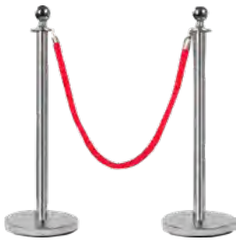
Velvet Rope & Chrome Stanchions