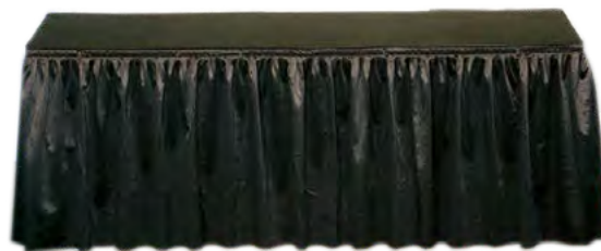
6' Table with Vinyl Table Top