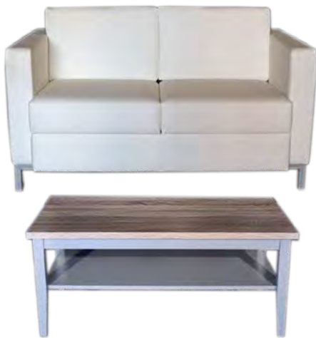
Love Seat & Coffee Table