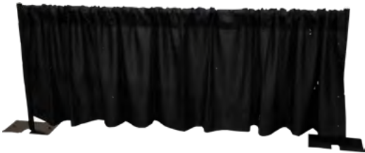
3' High Pipe and Drape