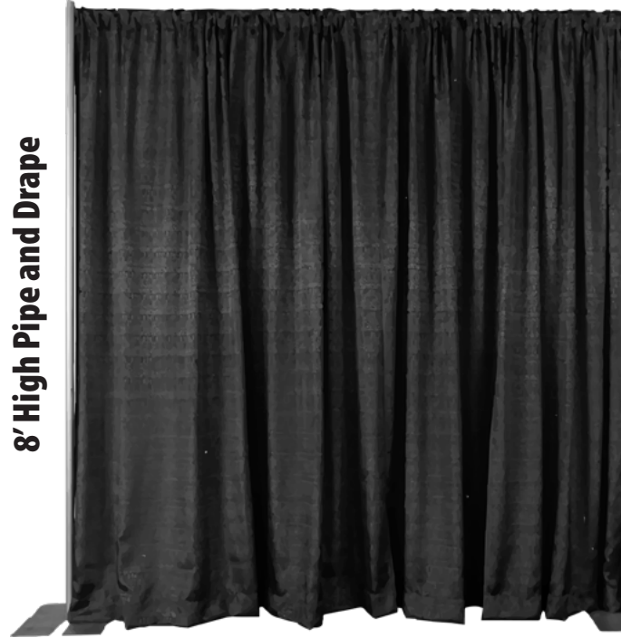
8' High Pipe and Drape