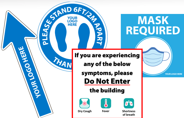
Pre-Made Signs & Floor Decals