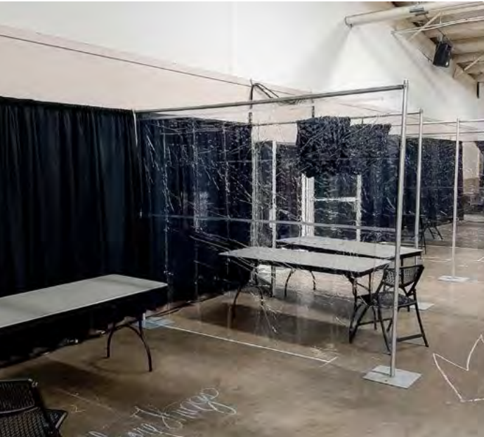
Non-Porous Clear Vinyl Booth Side Wall