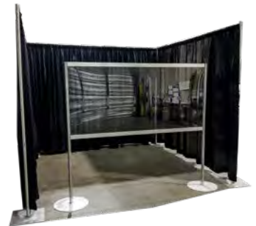
Large Plexi Barrier