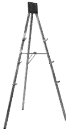
Easel Sign Holder