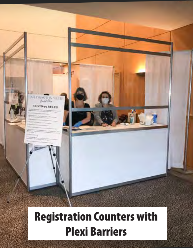
Registration Counters with Plexi Barriers