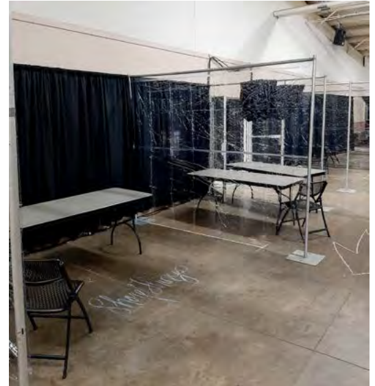
Non-Porous Clear Vinyl Booth Side Wall