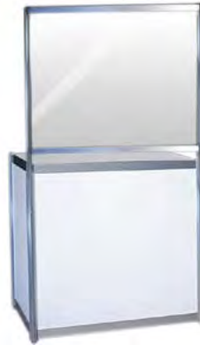
1-Metre Plexi Display Counter