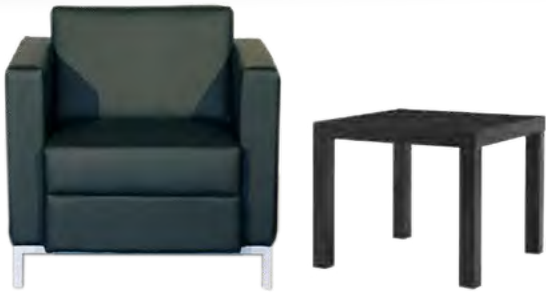
Club Chair & End Table