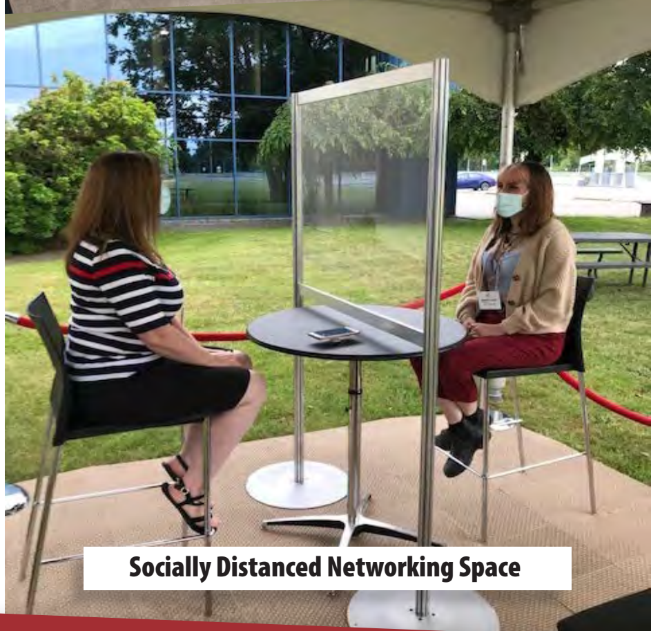
Socially Distanced Networking Space