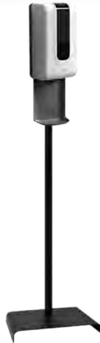
Hand Sanitization Stand