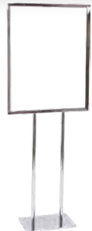
22"x28" Sign Holder