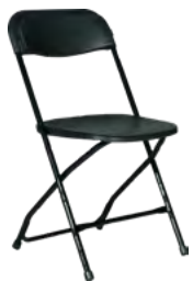
Black Folding Chair